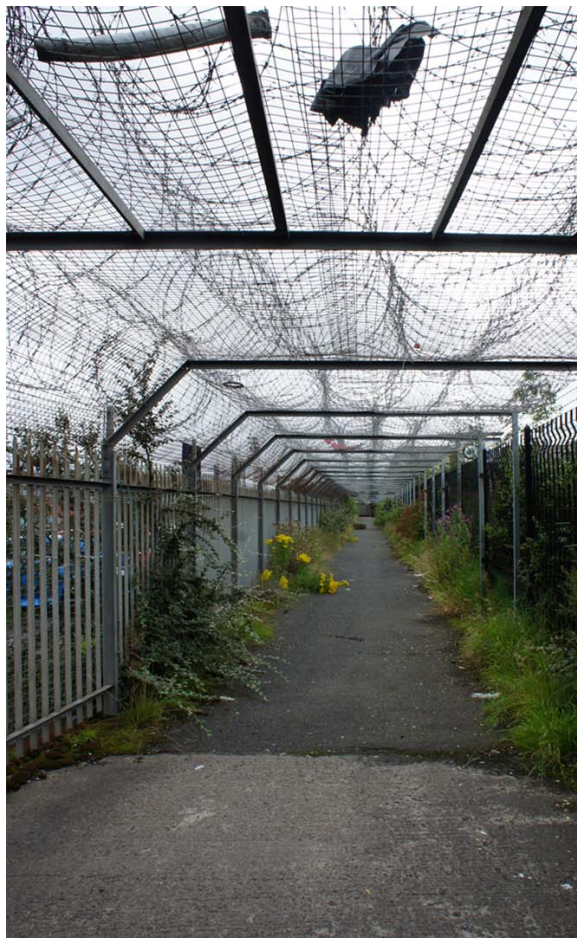
Figure 9 The architectural and urban structures of the Belfast football derby: the fortified pathway for visiting supporters connecting Bouchier Road with Windsor Park.

Spatially this pathway and similar enclosed routes for visiting fans at Windsor Park and to a lesser extent at Solitude 35 are an amalgamation of checkpoint-type architecture and the Belfast ‘peacelines’ albeit with the important temporal quality of only being used on match day (figure 9). Nevertheless they are permanent structures in the city that support the segregated congregation of the local football derby in the particular urban condition of divided Belfast. Re-imagining these crude architectural devices within the context of regenerating Belfast’s football grounds will be an important challenge for architects and planners. As O’Dowd and Komarova have found in their work on regeneration in Belfast, conflict over residential development remains intransigent and deep-rooted but there is ‘evidence of transition to less exclusivistic attitudes in leisure and work spaces’ (O’Dowd and Komarova, 2011: 2013). It could be argued that football clubs have an opportunity to develop more careful interventions in the environment around their grounds that can accommodate temporal segregation during matches without the highly visible apparatus of security that is currently employed.