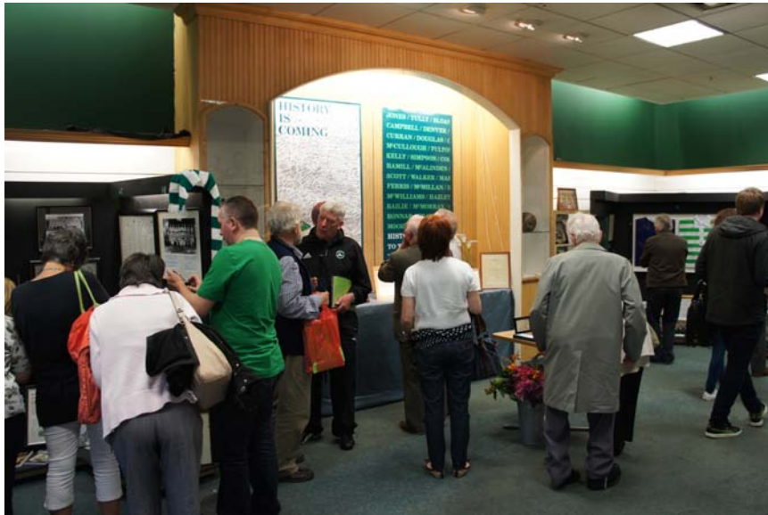
Figure 3 Commemorating Belfast Celtic: the Belfast Celtic Museum during the launch of the Belfast Celtic trail through West Belfast

and commercial spaces of West Belfast. The memorialisation of Belfast Celtic provides a counterpoint to another example of the relationship between conflict, memorialisation and sport in Belfast: the plan to build Northern Ireland's new 'national' sports stadium on the former site of the Maze prison. This proposal was an attempt to re-imagine an urban space loaded with divisive and sectarian meaning as a site of reconciliation (Bairner, 2006). However the idea was hotly contested and ultimately abandoned in favour of regenerating the city's existing stadia 16 .