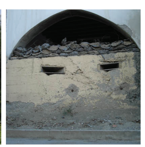
The edges of Nicosia's 'Dead Zone'.