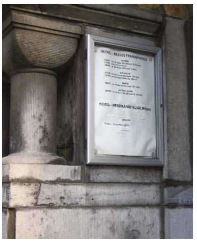
Timetable for Mass in French and Flemish. Church at the border between the Brussels Capital Region and Flanders.

Sometimes quite distinctive activities and priorities lead to sharing of space, with Jerusalem's Damascus Gate a good example. Here, most interaction is minimal, stressful, and sometimes violent, with Israeli soldiers doing spot checks on Palestinians. But on Fridays before sunset, just as Palestinian commercial activity begins to wane, Orthodox Jews enter this gate on their way to pray at the Western Wall. There are no cordial relations, but