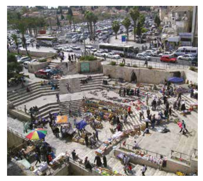
Damascus Gate is the busiest way into Jerusalem's Old City. The amphitheater outside the gate was constructed by the Israeli Municipality but is rarely used as the designers intended. Instead, Palestinian vendors have laid claim to the hard, staggered landscape, filling every available ledge and step with goods.

Regeneration projects can also address the needs of groups who are not accommodated by high-profile projects and approaches. In the face of Israeli attempts to Judaise the city, Palestinians draw on renovation and restoration as they struggle to preserve their own neighbourhoods. This is demonstrated in the work of one organisation which restores residential courtyards in Jerusalem's Old City as a means of both reinforcing Palestinian heritage and ensuring that Palestinians have decent places to live, giving them incentive to remain in their homes. It also provides training in conservation and pursues social outreach programmes in support of the surrounding community. Another organisation has completed work on 800 properties including public buildings, homes, schools, clinics and clubs. Work such as this reinforces the value of simple and practical regeneration initiatives that can help to meet local needs, offer residents alternatives in severe conflict situations, and help to maintain or re-establish urban connections.