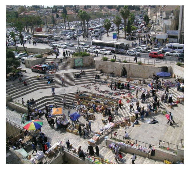
Damascus Gate is the busiest way into Jerusalem's Old City. The amphitheater outside the gate was constructed by the Israeli Municipality but is rarely used as the designers intended. Instead, Palestinian vendors have laid claim to the hard, staggered landscape, filling every available ledge and step with goods.

Regeneration projects can also address the needs of groups who are not accommodated by high-profile projects and approaches. In the face of Israeli attempts to Judaise the city, Palestinians draw on renovation and restoration as they struggle to preserve their own neighbourhoods. This is demonstrated in the work of one organisation which restores residential courtyards in Jerusalem's Old City as a means of both reinforcing Palestinian heritage and ensuring that Palestinians have decent places to live, giving them incentive to remain in their homes. It also provides training in conservation and pursues social outreach programmes in support of the surrounding community. Another organisation has completed work on 800 properties including public buildings, homes, schools, clinics and clubs. Work such as this reinforces the value of simple and practical regeneration initiatives that can help to meet local needs, offer residents alternatives in severe conflict situations, and help to maintain or re-establish urban connections.